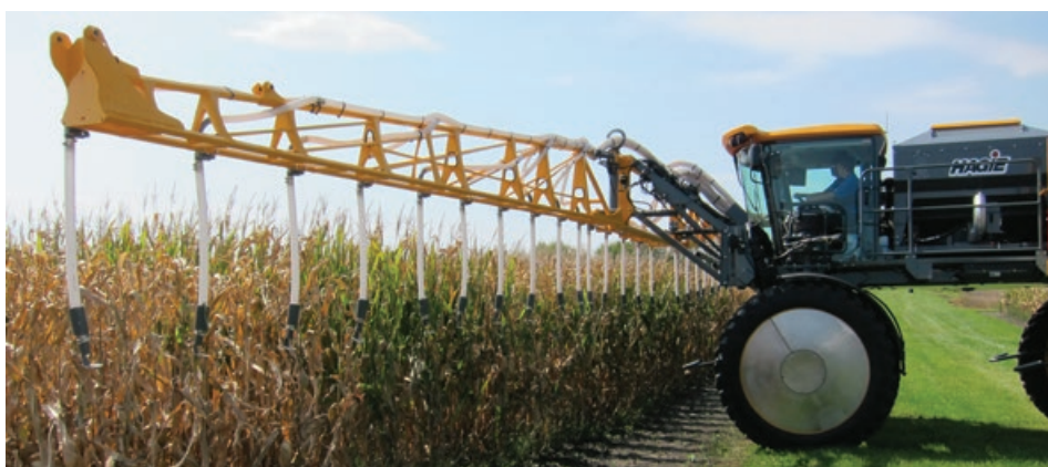
A cover crop interseeder can broadcast several hundred acres of cover crop seed in a day, allowing ag retailers and farmers to get cover crop seed established efficiently and early in the fall.

application, the cost of seeding is basically covered as part of the fertilization cost.