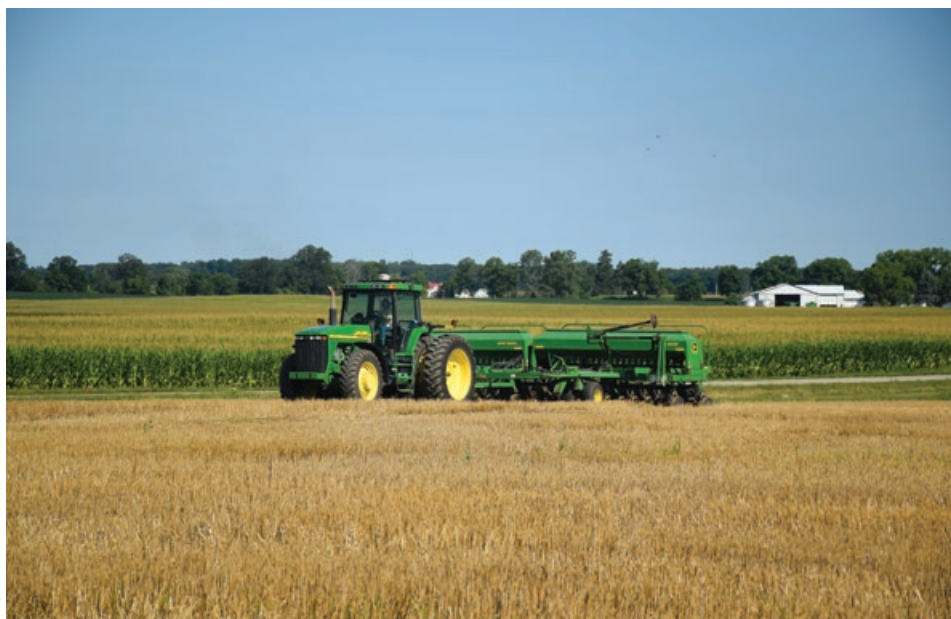
Four types of cover crops, including annual rye, oilseed radish, crimson clover and rapeseed, are being seeded into wheat stubble.

A positive first-year return from cover crop use will often occur during drought conditions, where cover crops are grazed (assuming that grazing infrastructure is already in place), or potentially in a situation with challenging herbicide-resistant weeds. When converting from conventional till to no-till, cover crops can help ease that transition, making it possible to break even in year one