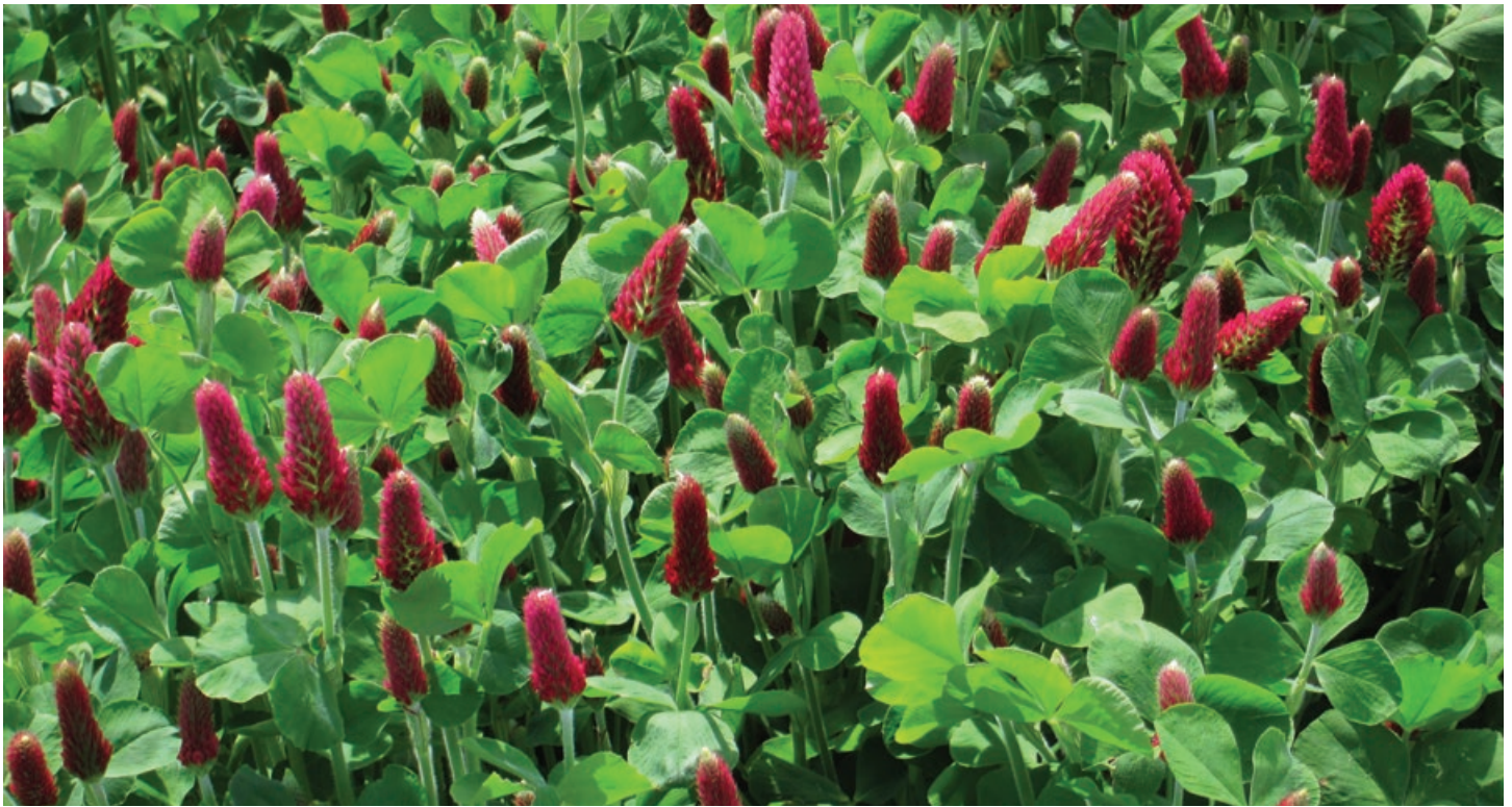
Crimson clover is the most popular legume cover crop in the United States.

a few fields having yield losses after cover crops and with some fields showing no difference. Many farmers reported a yield increase on their fields, but individual experiences varied. While the SARE/CTIC survey data set is by far the largest set available on cover crop yield impacts, it is worth noting that other cover crop studies have reported a range of yield impacts, from minor losses to minor increases in corn yields. For soybeans, some studies have shown that yields are unchanged with cover crops, while others have shown a modest improvement in yields. Fewer data reports are available on the yield impact of cover crops on other cash crops.