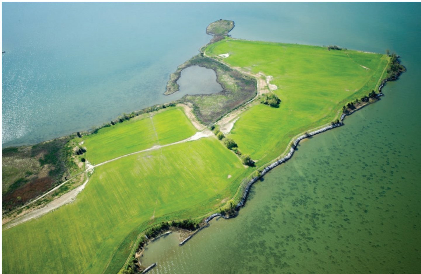
Researchers have found that cover crops are very effective at protecting water quality. Here, cover crops are growing in fields along the Chesapeake Bay.

The real-world effect of farm activities extends well beyond the farm gate. Collectively, the activities of farming operations affect not only regional ecosystems but also rural communities and society as a whole. As part of a holistic review of cover crop economics, it is worth noting some of the ways that cover crops can influence off-farm economics, especially in a consumer culture where buyers increasingly want to know the origin and environmental impact of the products they buy.