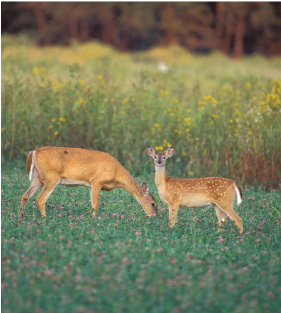
Cover crops can represent a recreation opportunity by helping to provide year-round food and habitat for wildlife such as deer.

the field and the less total risk of erosion. Eroded soil particles carry sediment with them into waterways.